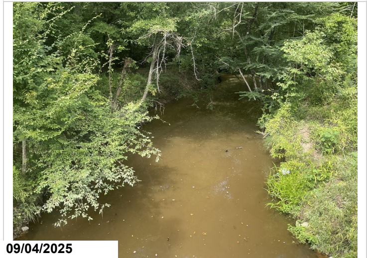
Upstream channel overview left side