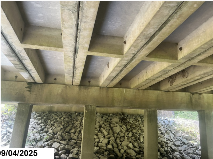
Span 2 undersurface overview